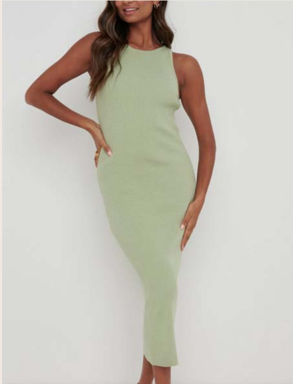
Rib Knit Dresses that flatter and accentuate your natural curves.